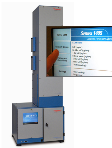
Thermo Scientific™ TEOM™ 1405-DF Ambient Particulate Monitor

The 1405-DF monitor provides a self-referencing, NIST-traceable true mass measurement using our own proven high reliability TEOM technology. The system differentiates itself from other PM measurement methods by utilizing a direct mass measurement that is not subject to measurement uncertainties found in surrogate techniques such as beta attenuation, light scattering and pressure drop.