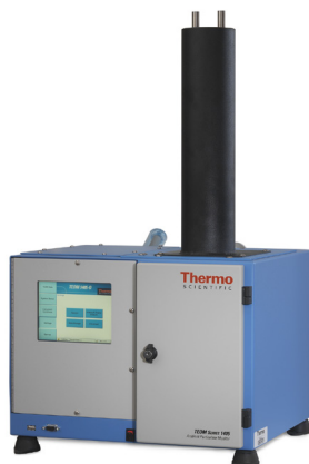
Thermo Scientific™ TEOM™ 1405-D Monitor

The 1405-D monitor provides a self-referencing, NIST-traceable true mass measurement using our proven high reliability TEOM technology. The system differentiates itself from other PM measurement methods by utilizing a direct mass measurement that is not subject to measurement uncertainties found in surrogate techniques such as beta attenuation, light scattering and pressure drop.