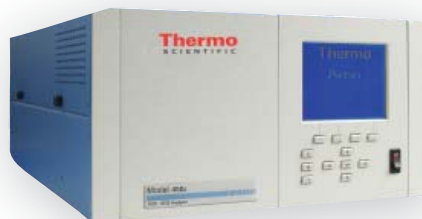
Thermo Scientific Model 450i Hydrogen Sulfide & Sulfur Dioxide Analyzer

You can easily program short cut-keys to allow you to jump directly to frequently accessed functions, menus or screens. The larger interface screen can display up to five lines of measurement information while primary screen remains visible.